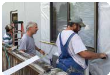
Webber Work Day .....