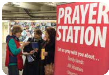
New York City Trip .....