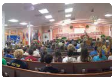
Florida Day of Champions.....