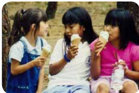
Native American girls at a previous camp week

Facilitation is a great way to see God's work accomplished too. We do not minister on a Native American reservation, but we can facilitate a Christian camp where missionaries can bring